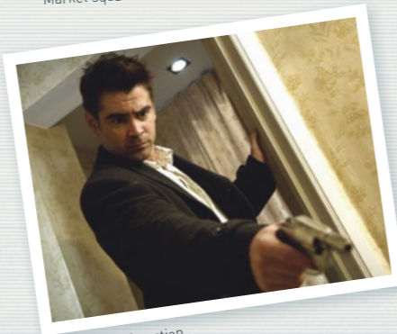
Colin Farrell in action