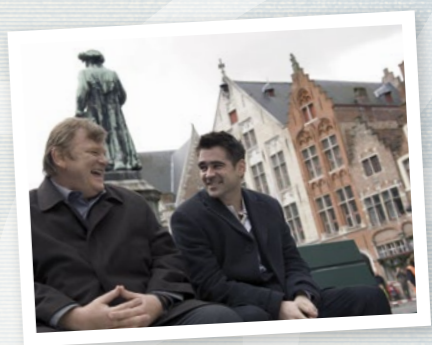
Jan Van Eyckplein