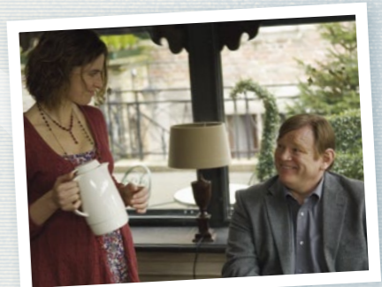
Relais Bourgondisch Cruyce